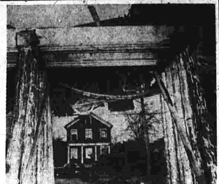
The underside of a car is smashed through this temporary wooden trestle in Woodbridge, N. J., where a jammed Pennsylvania railroad commuter train met disaster. The wooden structure collapsed, and the train plunged down a steep embankment, killing 85 and injuring some 500.

stated by a strong Communist force on the southern outskirts of Chobal, 30 miles north of Cheonan.