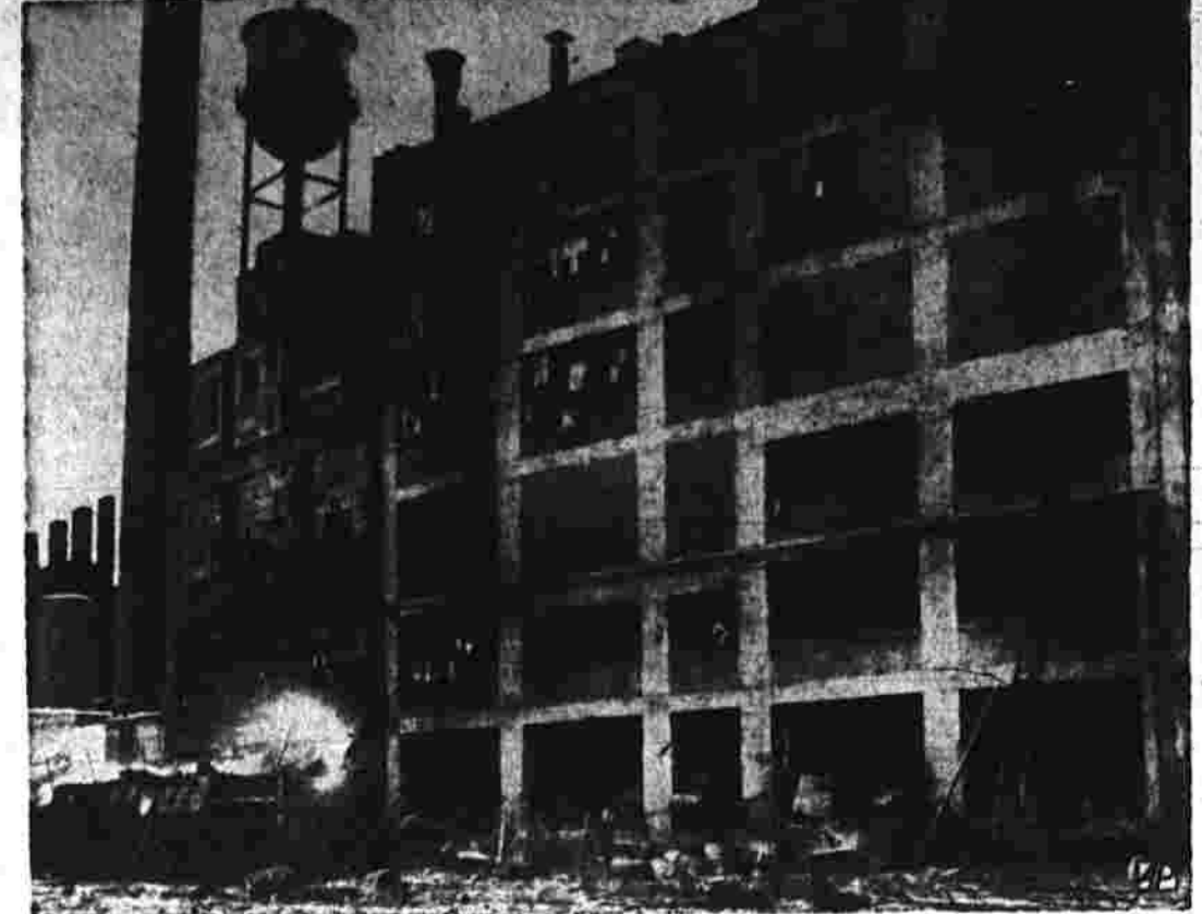
This is a general view of wreckage of the Minnesota Mining and Manufacturing Co. plant in St. Paul, Minn., following an explosion. The company manufactures, among other things, cellophane tape under the trade name of "Scotch" Tape.